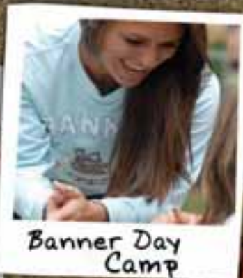
Banner Day Camp